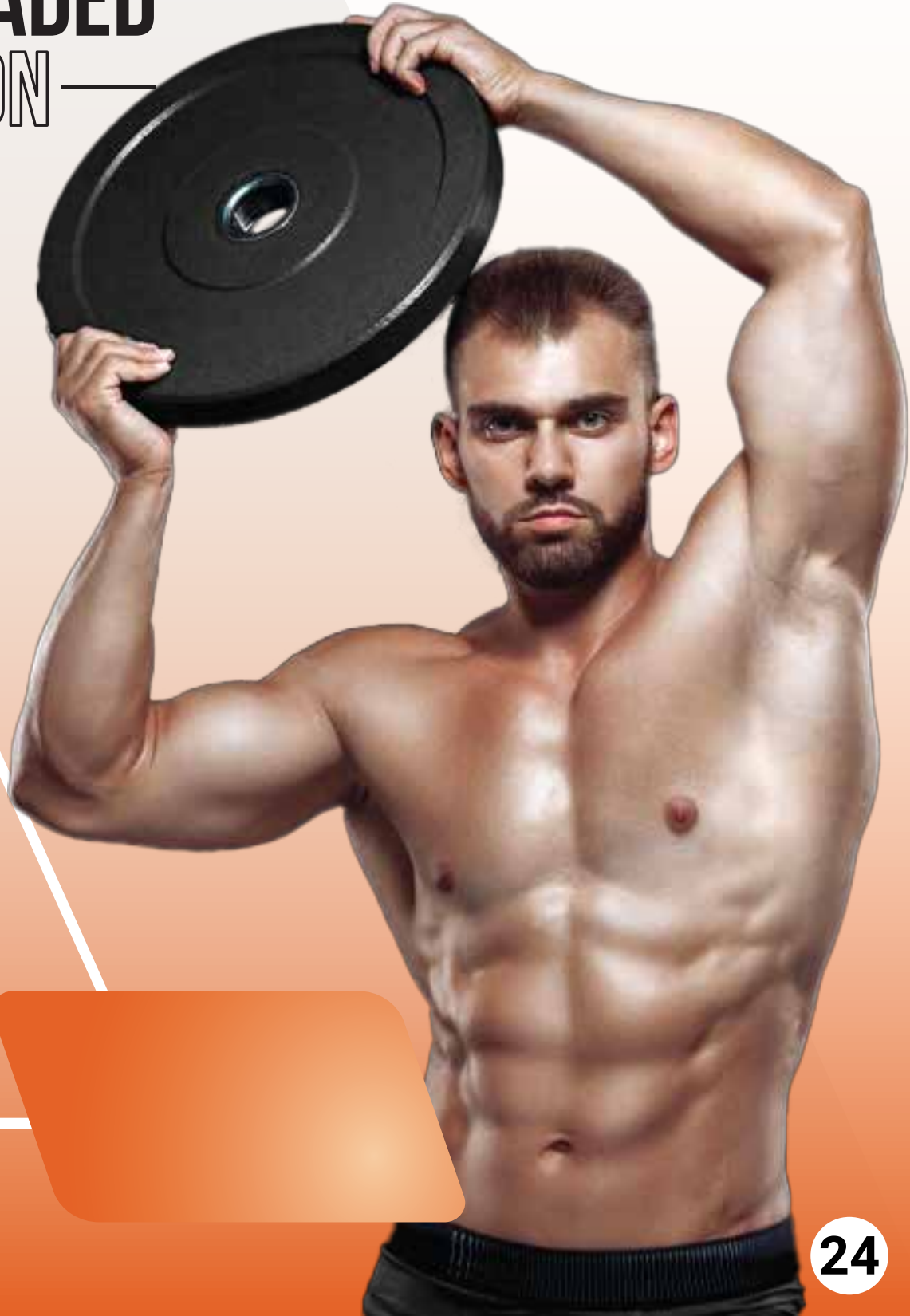
PLATE LOADED SECTION